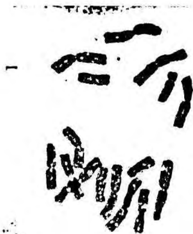
Figure 3. Chromosomes of Ceratozamia sabatoi at mitotic metaphase, bar = 2 \mu m.

xalapensis Humboldt & Bonpland. The soil is a dark humus-rich clay on limestone.