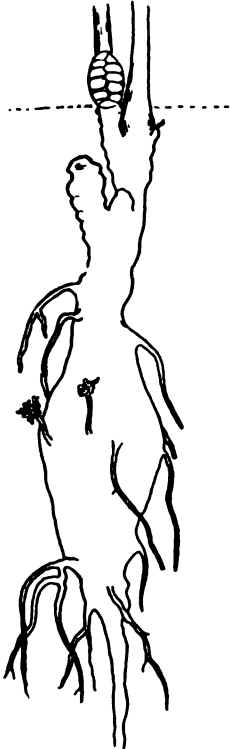
FIG. 3.— Bowenia spectabilis : a somewhat diagrammatic sketch of the stem of an ovulate plant; the portion shown is somewhat less than 1 m. in length; the dotted line is the ground line.

The most striking difference between the species and the variety is in the stem, which is subterranean in both. In the species the stem is somewhat carrot-shaped, with one or two, sometimes four or five, slender branches at the top (fig. 3). These slender branches bear all the leaves and cones.