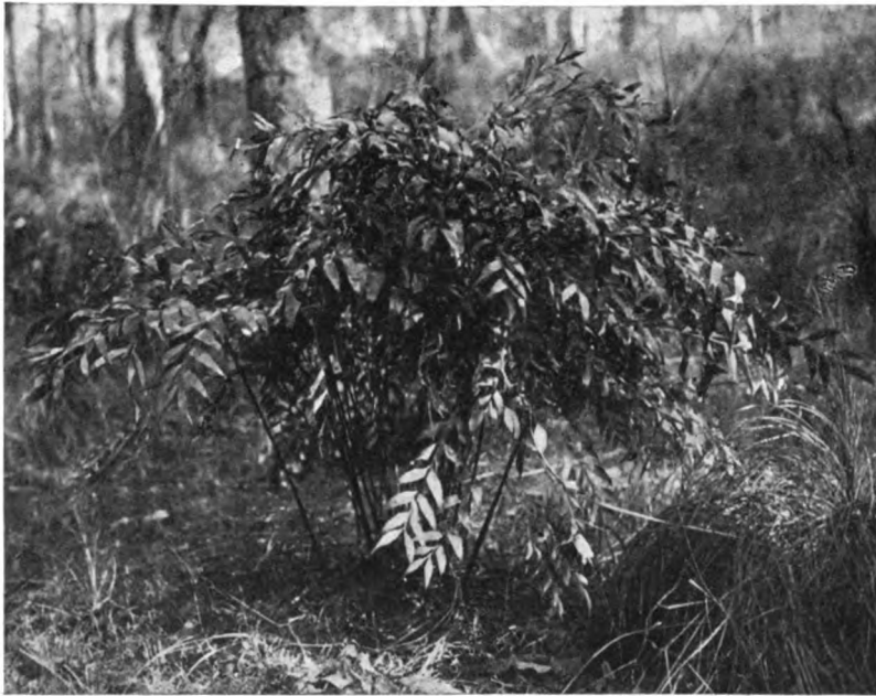
FIG. 2.— Bowenia serrulata at Byfield, Australia: about 1.3 m. in height

As found in nature, the species and the variety are noticeably different, the latter having a greater display of foliage (figs. 1 and 2). The species is most abundant in open places and clearings, while the variety is most abundant in the bush. Many specimens of the species in shaded places along streams are larger and taller than forms growing in the open, the leaves sometimes reaching a length